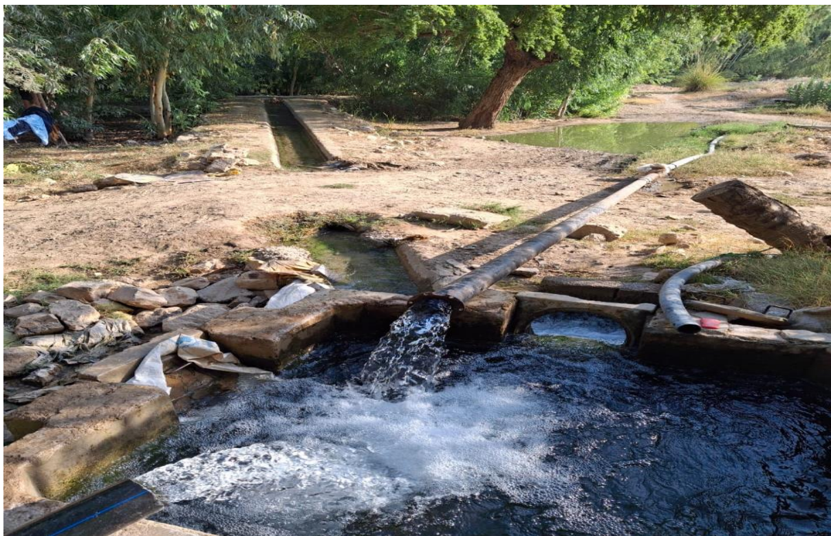
Figure 2: Field visit of Balochistan during the month of November 2024