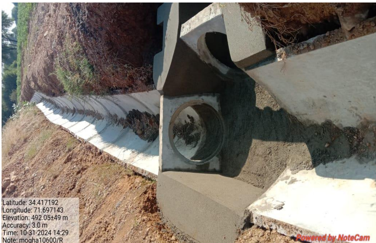
Figure 3: Field visit of Khyber Pakhtunkhwa during the month of November 2024