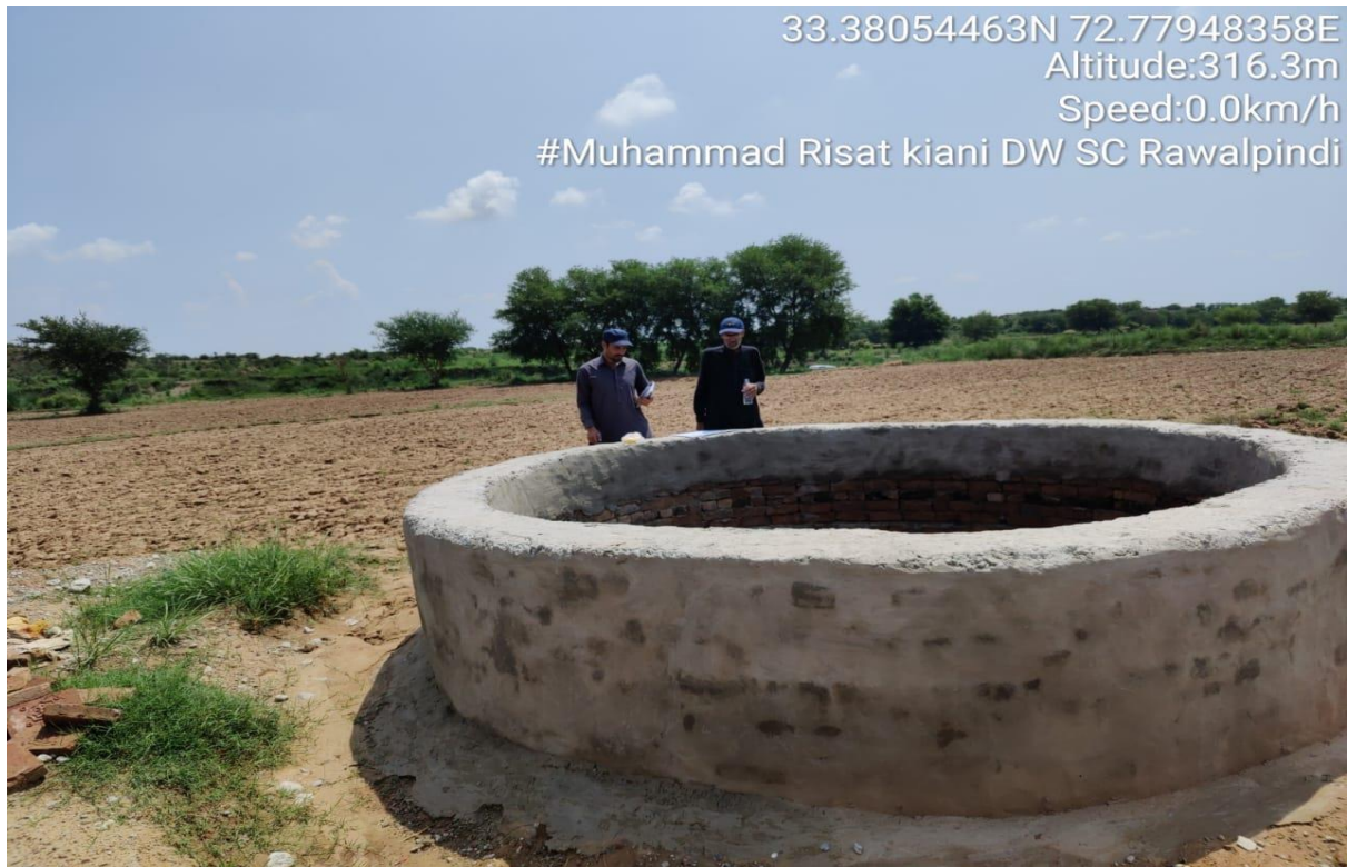
Figure 1: Field visit of Punjab during the month of November 2024