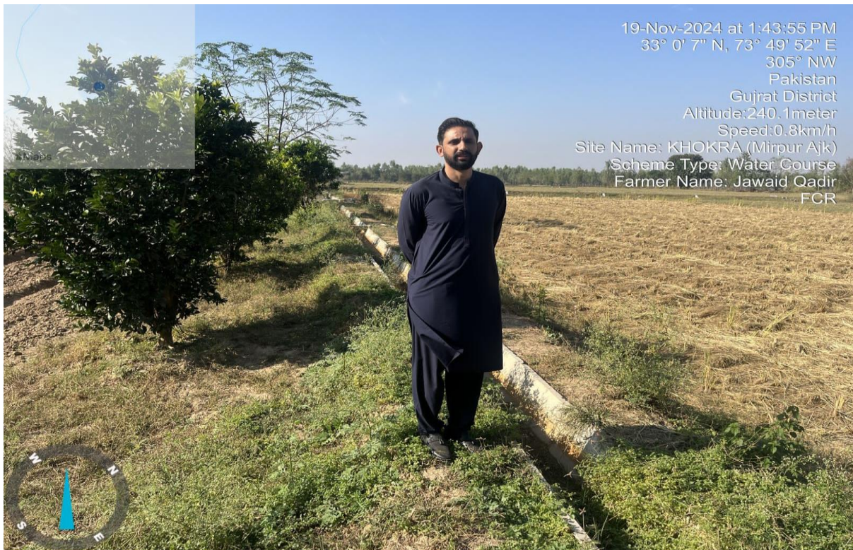
Figure 4: Field visit of Azad Jammu and Kashmir during the month of November 2024